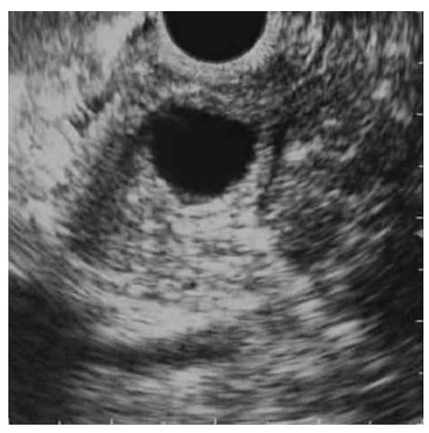
Figure 1. EUS of the ampulla of Vater showing cystic dilation of terminal pancreatic duct.

Wirsungocele is the term coined for cystic dilation of the terminal part of the duct of Wirsung. We found a total of eight cases of wirsungocele described in five papers indexed in PubMed [1, 2, 3, 4, 5]. Abu-Hamda et al. first described wirsungocele as an incidental finding on ERCP [1]. Four of these cases (50.0%) of wirsungoceles are associated with acute recurrent pancreatitis [1, 2, 3, 4, 5]. Five reported cases (62.5%) are males and age of presentation is after 4<sup>th</sup> decade [1, 2, 3, 4, 5]. Endoscopic pancreatic sphincterotomy and stenting appears very effective and durable [2, 3, 4].