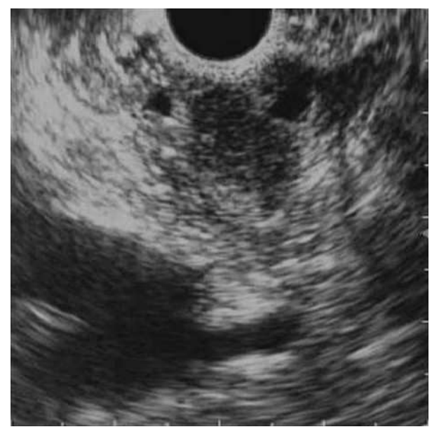
Figure 2. EUS of the ampullary region showing hypoechoic lesion at the ampulla. The wirsungocele is also seen.

Our patient also had good symptom relief following endotherapy. EUS as a diagnostic tool has not been used adequately so far. For the first time we could demonstrate wirsungocele on EUS and its association with neuroendocrine tumor.