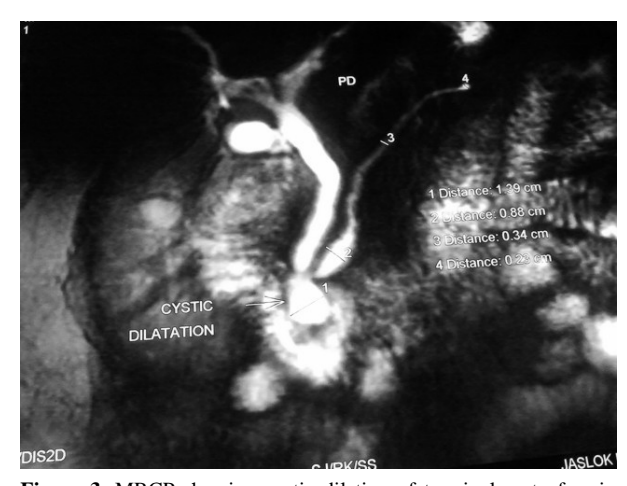
Figure 3. MRCP showing cystic dilation of terminal part of main pancreatic duct.

This case report highlights the diagnostic utility of EUS in diagnosing small ampullary pathology like