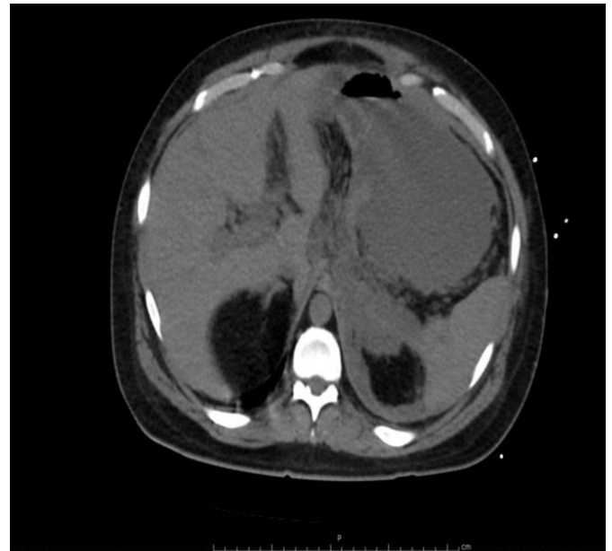
Figure 1. CT scan abdomen/pelvis showing hemorrhagic pancreatitis with extensive necrosis in patient 1.

A Forty-five-year-old Caucasian male was brought to the ED after being found unconscious by his fiancé. She