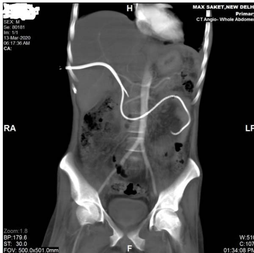
Figure 2. CT abdomen showing a PTBD catheter and a trans hepatic jejunal catheter in place.

with small oral feeds which he tolerated. Feeds were also continued through Tran’s hepatic catheter. Catheter related complications included occasional catheter blockage occurred which required aspiration and flushing.