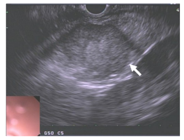
Figure 2. Endoscopic ultrasound image demonstrates a well defined, heterogeneous mass in the pancreas.

PEComa is a term that describes "a mesenchymal tumor composed of histologically and immunohistochemically distinctive perivascular epithelioid cells" [11]. The term has been used to describe a group of related pathologic processes including epithelioid renal angiomyolipoma, lymphangiomeyomatosis, clear cell sugar tumor of the lung, clear-cell myomelanocytic tumor of the falciform ligament/ ligamentum teres, as well as clear cell tumors in other anatomic locations [5]. PEComas have been described in the bladder, prostate, uterus, ovary, vulva, vagina, liver, bone, orbit, retroperitoneum, soft tissue, nasal cavity, pelvis, GI