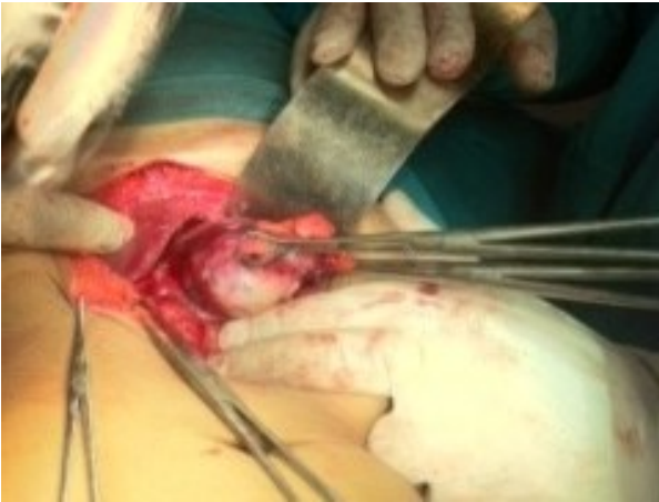
Figure 2. Preoperative cyst.