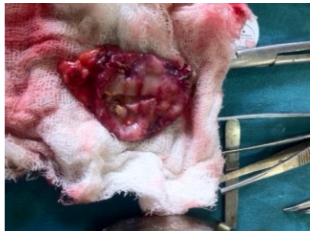
Figure-3. Excised cyst.

Pseudocysts having wall thickness greater than 1 cm, which is more than 6-week-old, having pancreatic duct abnormalities, are multiple, located in tail of pancreas