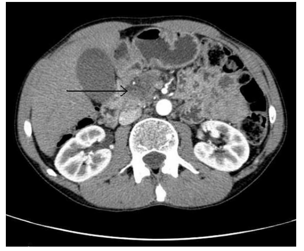
Figure 1. Preoperative CT scan showing a tumour in the head of the pancreas (shown by an arrow).

computed tomography (CT). The CT scan was reported as showing a 3 cm transverse diameter mass in the head of the pancreas with dilatation of the proximal main pancreatic and duct and two hypodense areas in the liver (Figure 1). He was referred urgently to the Hepatobiliary Service some four months after his index presentation. The patient had a full Karnofsky score [8] and had no co-morbidity of note.