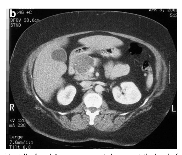
Figure 1. CT scan of a patient with appendicitis (a) and an incidentally found 5 cm serous cystadenoma at the head of the pancreas (b).

Cystic neoplasms of the pancreas are unusual tumors making up less than 6% of all resectable pancreatic neoplasms [1]. Likewise, mucinous cystadenomas of the